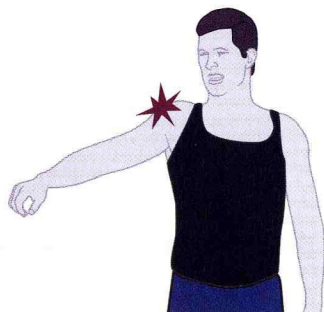
A rotator cuff injury can make it painful to lift your arm to the side.

Magnetic resonance imaging (MRI) and ultrasound. These studies can create better images of soft tissues like the rotator cuff tendon. An MRI may show how large a tear is.